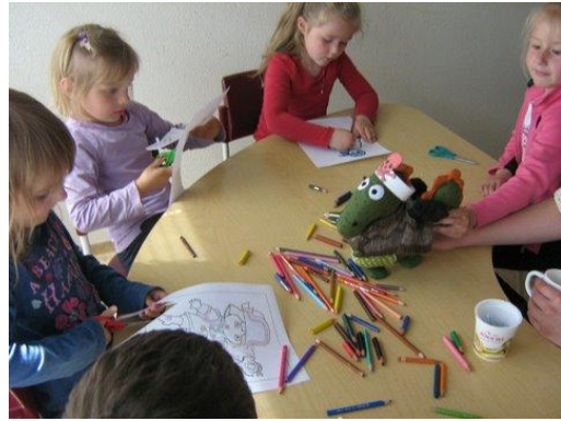
Helping the children.