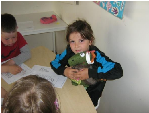
Katla likes to sit in the lap and get a hug.