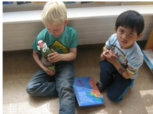
She loves to read books and to learn many things.

At last everybody ate hot dogs from the barbeque. Katla loves hot dogs but she was wondering if it would be even better if she would grill them by the fire from her mouth. It is maybe too dangerous even though we have a lot of water here in Iceland.